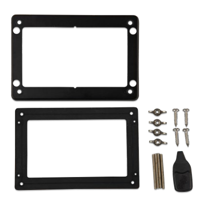
Accessories included with the GX Touch