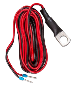
Temperature sensor for Quattro, MultiPlus and GX Device (such as the Cerbo GX)